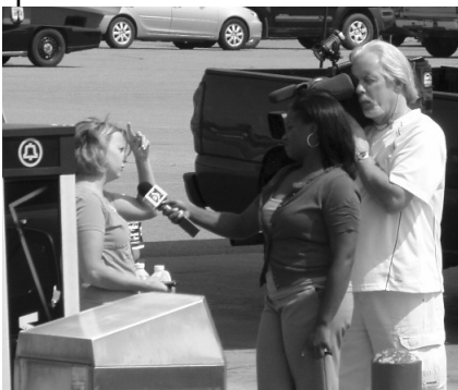
The press covered us along the Tour.

return to do the Cruise. Rain cut our time short to only three hours, but nevertheless the impact was made and much literature was distributed, and our truthtrucks kept driving down Woodward Ave. past the hundreds of thousands watching the Cruise .