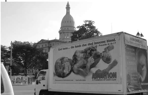
Our truthtruck outside the Capitol.

A team of less than 30 assembled for this effort. All of the stops we made at intersections were very busy. We also did a stop outside the Michigan State Capitol to greet the legislators and their staffs as they arrived. The Personhood Amendment in Michigan is bottled up in the Judiciary Committee and we gathered to call upon them to act on the bill and get it out of Committee for a full vote. The building was abuzz about our efforts!