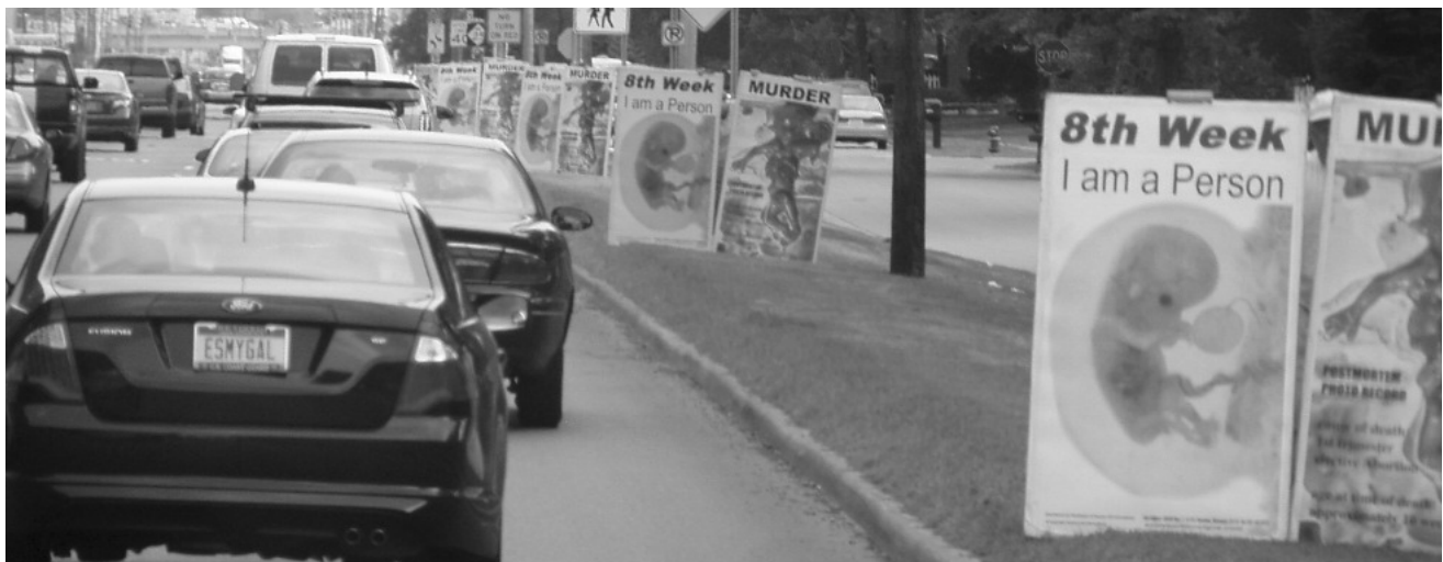
The view in Port Huron, Michigan. All our stops were thick with traffic.

A team of less than 30 assembled for this effort. All of the stops we made at intersections were very busy. We also did a stop outside the Michigan State Capitol to greet the legislators and their staffs as they arrived. The Personhood Amendment in Michigan is bottled up in the Judiciary Committee and we gathered to call upon them to act on the bill and get it out of Committee for a full vote. The building was abuzz about our efforts!