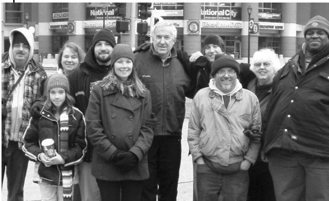
Some of the team that went to Urbana.

Had we not been outside on the streets speaking up for them, the students would have never had the unjust killing of the preborn brought to their minds. We put out thousands of pieces of literature, and had countless conversations.