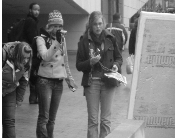
A common sight - students checking out our photographs and taking pictures.

Unfortunately, the leadership of the Urbana Conference, which is Inter-Varsity , continues to show abject neglect to the preborn. As we have written about before, they deny us to have a booth to display our mission (even though we met all the criteria) at the conference. They say that the preborn are NOT a legitimate people group, yet they allow groups whose "mission" it is to save trees into the conference and give them a booth! Even this time, there was an emphasis on social justice at Urbana. They focused in on AIDS and on the environment, but not one mention of the preborn!